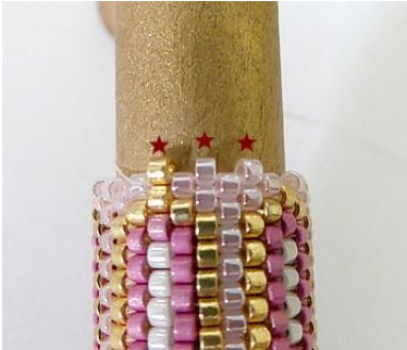
34) Pick up 2 DB LP and 1 DB G. DERLT