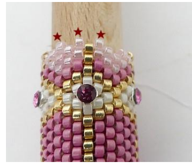
21) Pick up 1 a full row in DB LP