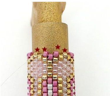
40) Pick up 1 DB G, 2 DB P and 1 DB G. DERLT