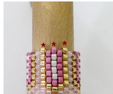
30) Pick up 1 DB G, 1 DB P and 1 DB G. DERLT