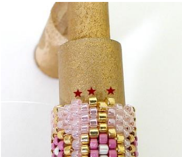
37) Pick up 2 DB G and 1 DB LP. DERLT