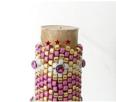
73) Pick up 2 DB G and 1 DB P. DERLT