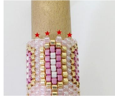
33) Make 1 a full row of DB LP