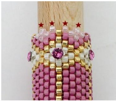
19) Place 1 a full row in DB LP