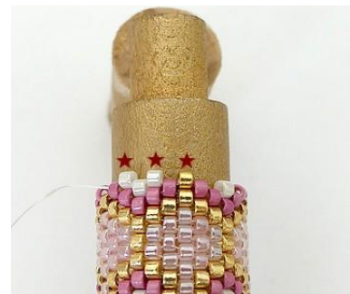
42) Pick up 1 DB G and 2 DB B. DERLT