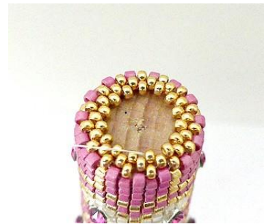
81) Make 2 rows of SB15. Tighten the work