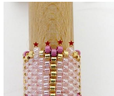
27) Pick up 1 DB LP, 2 DB P and 1 DB LP. DERLT