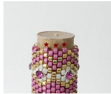
75) Make a row of DB P.