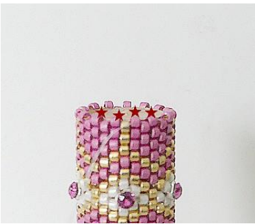
79) Make a row of DB P