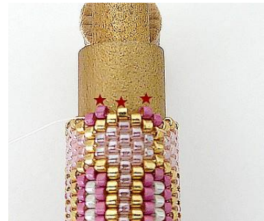
39) Pick up 1 DB P, 1 DB G and 1 DB P. DERLT