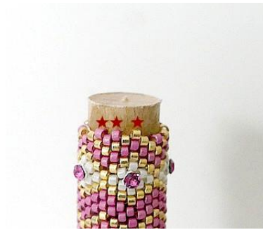
74) Pick up 1 DB G and 2 DB P. DERLT