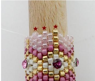
22) Pick up 1 DB G and 2 DB LP. DERLT