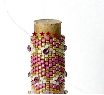
72) Pick up 1 DB G, 1 DB P and 2 DB G. DERLT