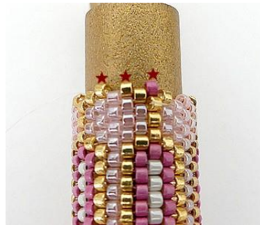
38) Pick up 1 DB P and 2 DB G. DERLT