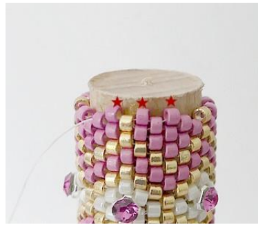
77) Make a row of DB P.