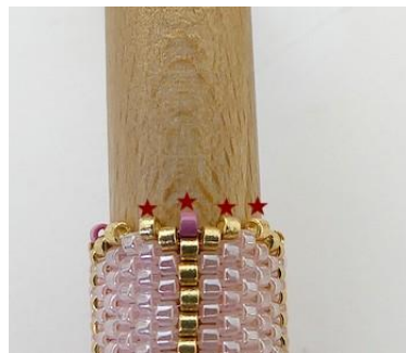
26) Pick up 2 DB G, 1 DB P and 1 DB G. DERLT