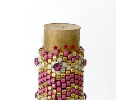
71) Repeat the steps 9 to 16 and pick up 1 DB G, 2 DB P. DERLT