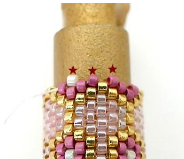
41) Pick up 2 DB P and 1 DB B. DERLT