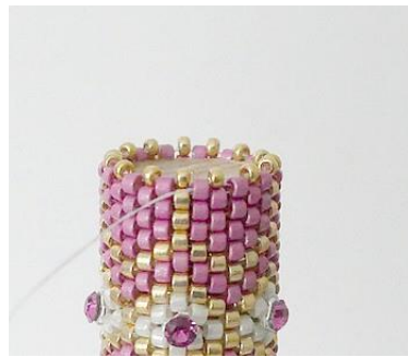
80) Make a row of SB15