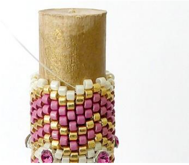
70) Make a row of DB B