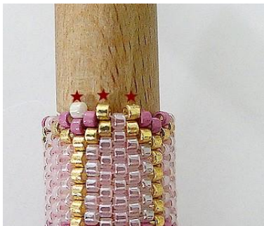
28) Pick up 2 DB G and 1 DB B. DERLT