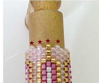
36) Pick up 1 DB LP, 1 DB G and 2 DB LP. DERLT