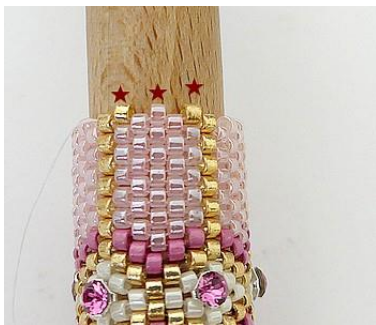
25) Pick up 1 DB G, 1 DB LP and 1 DB G. DERLT