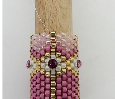
23) Here is the result 😊