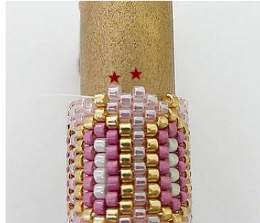
35) Make 1 a full row of 2 DB LP and 1 DB G