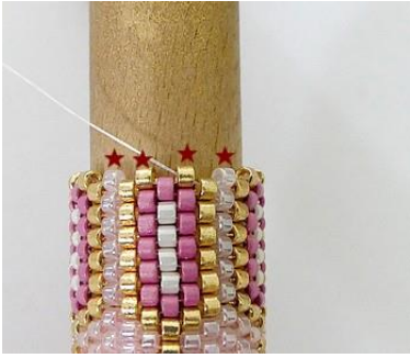
31) Pick up 1 DB LP, 2 DB G and 1 DB LP. DERLT