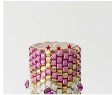
78) Pick up 2 DB P and 1 DB G. DERLT