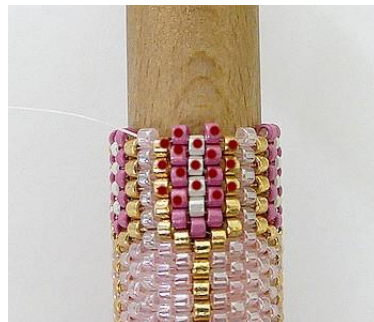
29) Repeat the steps 27 and 28 for 4 rows