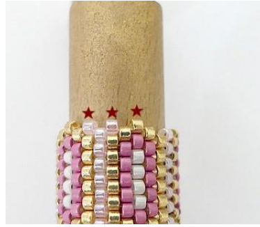
32) Pick up 1 DB G and 2 DB LP. DERLT