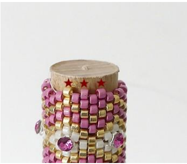
76) Pick up 2 DB P and 1 DB G. DERLT