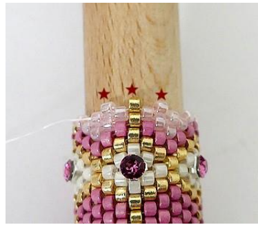
20) Pick up 1 DB LP, 1 DB G and 1 DB LP. DERLT